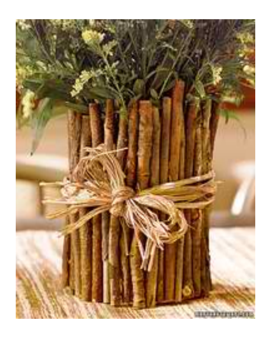
Cover a jar or vase with twigs and tie with twine or raffia for a rustic flower